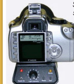
Superior lighting system includes variable light intensity adjustment and Xenon flash for precise exposure