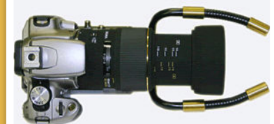
Features a superior system that includes fiber-optic lateral and medial lighting for better iris fiber definition.