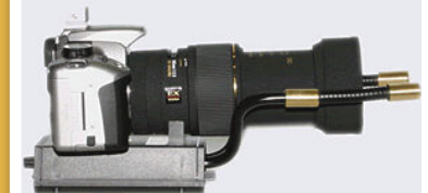
Portable, light weight, and easy to use. Rechargeable batteries for camera and flash.