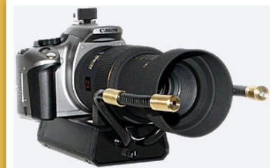
Excellent for Iridology and Sclerology. Also for animals, young children and elderly.

Check, Direct Deposit & Credit Card Independent financing is available Prices are exclusive of shipping, handling and insurance. Customs duties and taxes may apply.